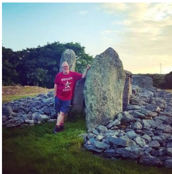
Trefignath Burial Chamber

As I mentioned, my holidays curtailed my digging this year but on my way back from my trip to Northern Ireland, I couldn't resist the opportunity of stopping at these sites on Anglesey;