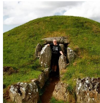
Bryn Celli Ddu Burial Chamber